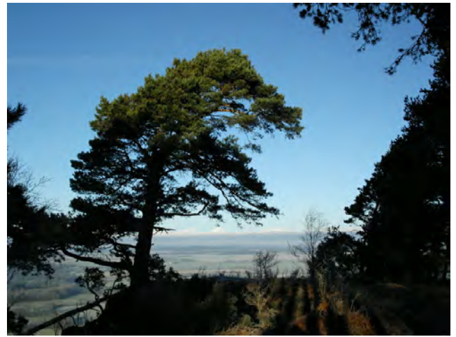
View from Touchadam Crag

takes your breath away: fantastic rising landscapes far below – and far in the distance: Touch, North Third, Earlshill, Ben Lomond, Ben Ledi, the vast, spectacular Carse of Stirling.