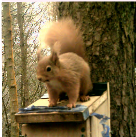
Photograph from 27th February 2012

Volunteers welcome ::contact John at 449697